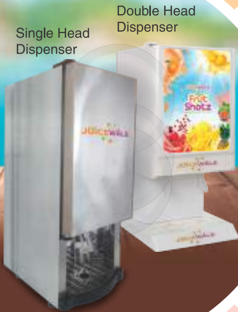
Double Head Dispenser